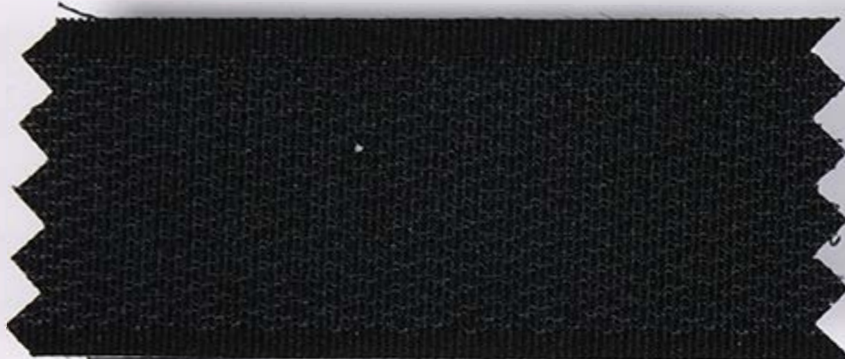
100% Nylon Hook

Application: shoes, apparel, hat, household products, medical products, sports products, etc.