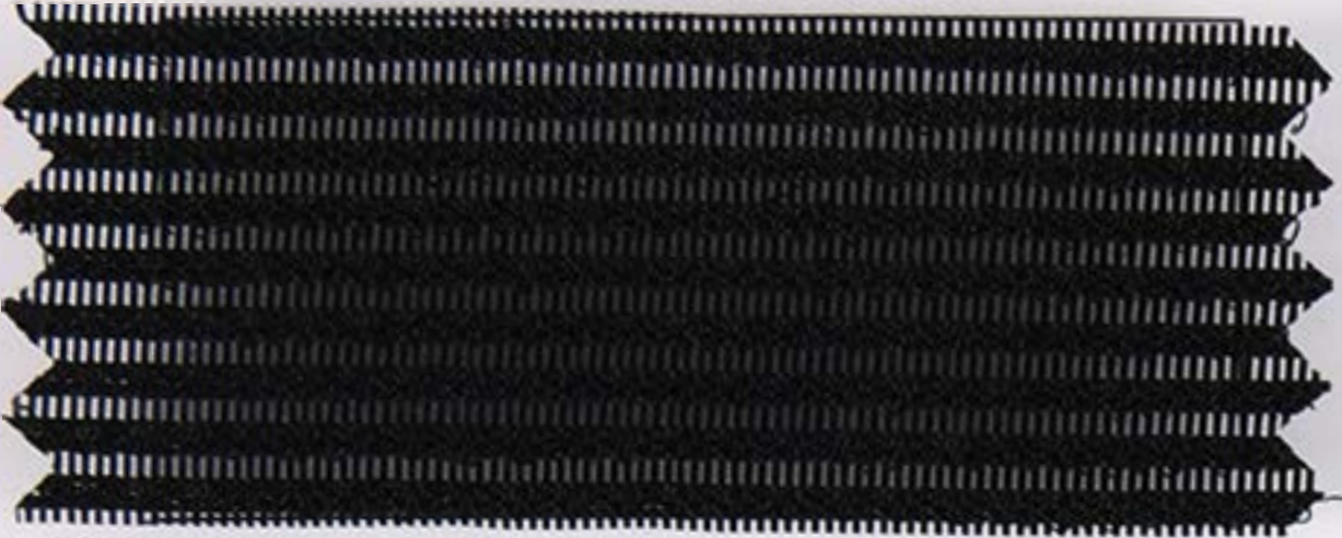
100% Nylon Hair Grip Pad

Application: Sports wear, compound hook and loop, medical products, labels, etc.