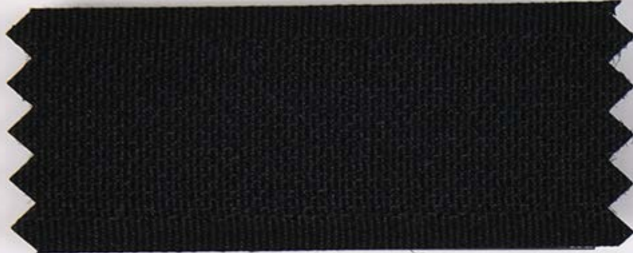
Polyester Nylon Loop

Application: Shoes, apparel, hat, household products, curtain etc.