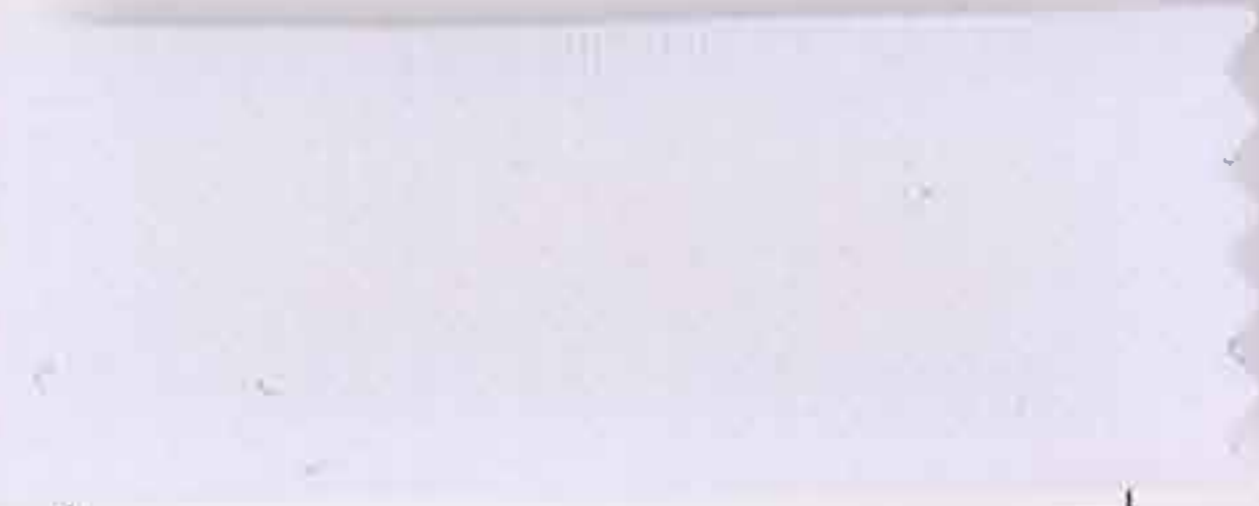
High Frequency Welding Loop

Application: Raincoats, storm jackets, outdoors, etc.