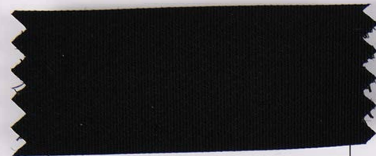
100% Nylon Un-Napped Loop

Application: It's designed for applications where opening & closing is rare or where super-strong bond is needed, like curtains, power tools, straps, and other scenes where need high adhesion.