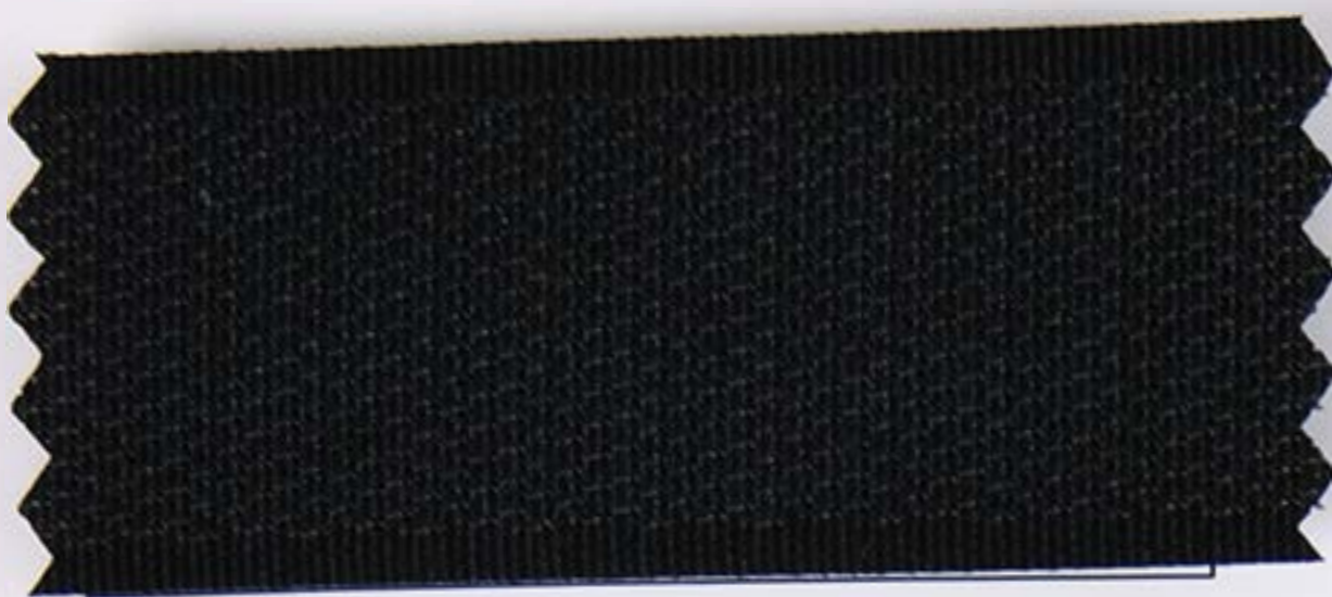
100% Nylon Hook