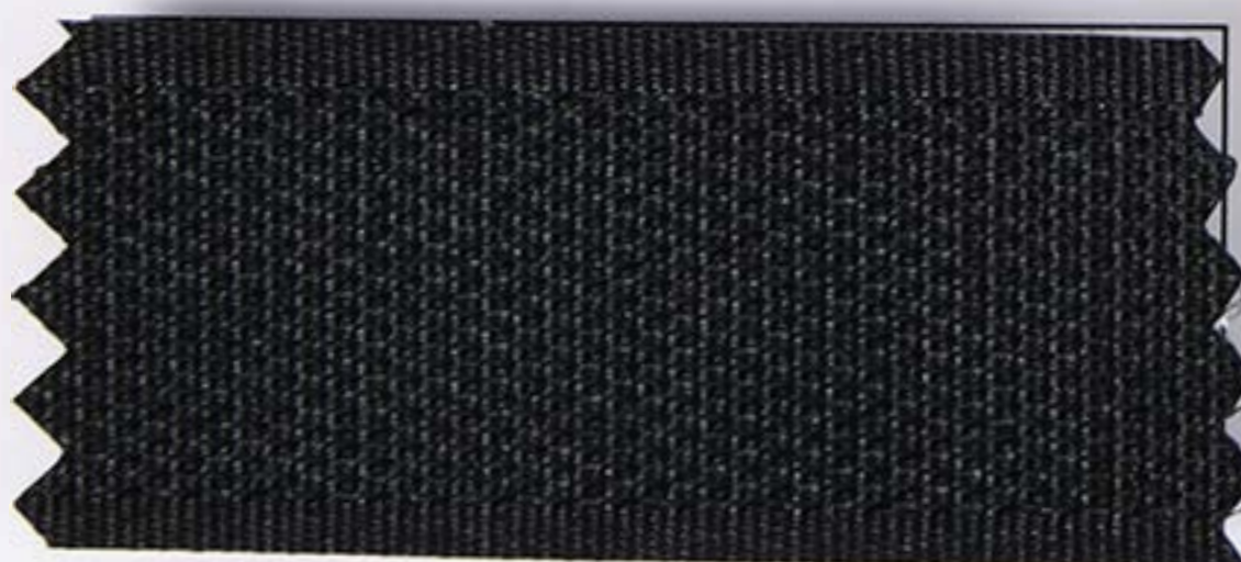
Polyester Nylon Hook

Application: shoes, apparel, hat, household products, medical products, sports products, etc.