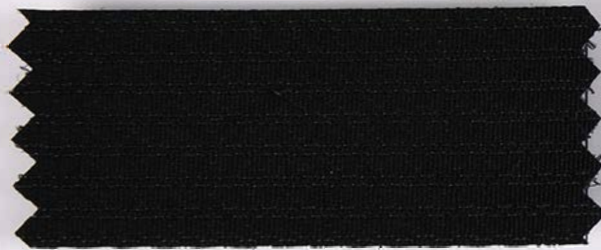
Self Gripping Hook & Loop (One Sided Hook and Loop)

Application: For applications requiring a higher cycle life and lower peel and shear strength, like children wear, sportswear, sports shoes, outdoors products