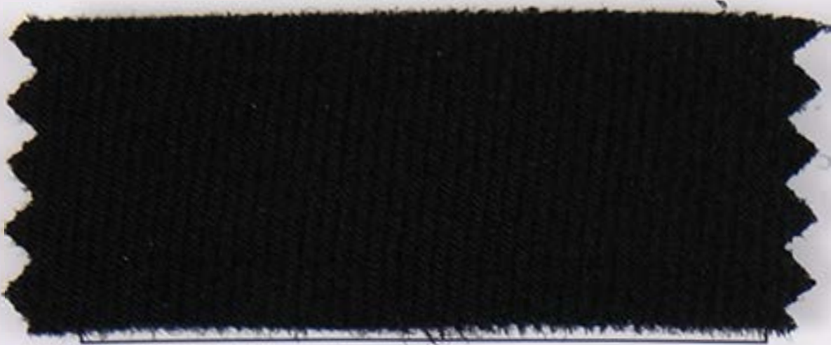
100% Nylon Napped Loop