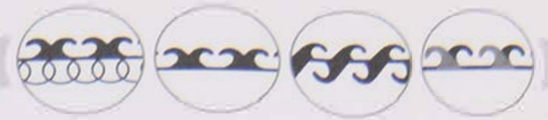
Molded Hook for Diapers