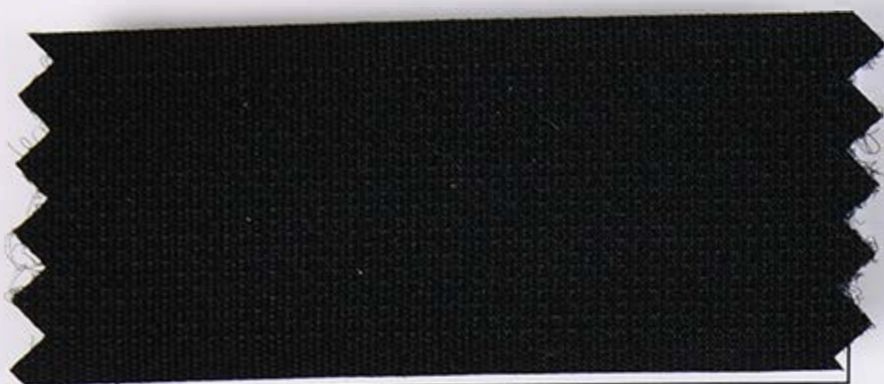
100% Nylon Loop

Application: Shoes, apparel, hat, household products, medical products, sports products, etc.