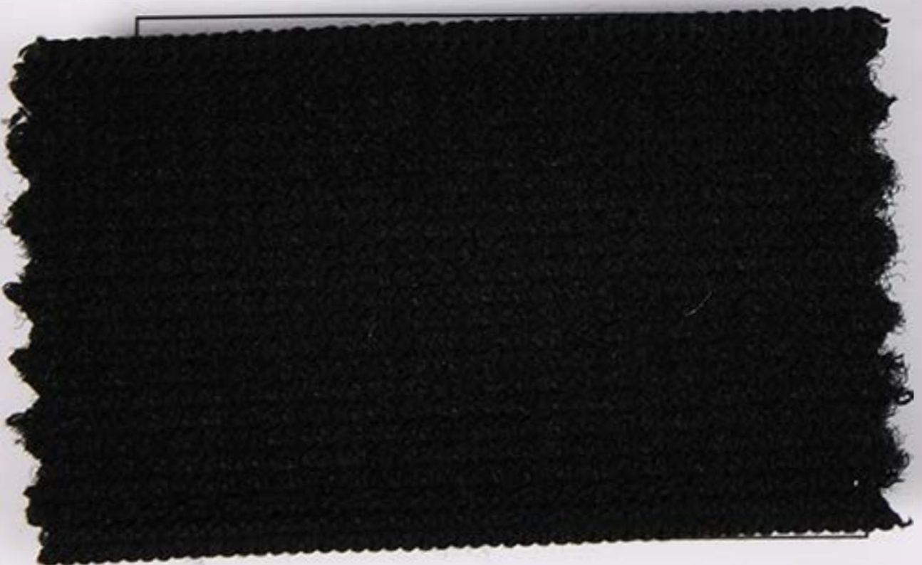
High-Density Elastic Hook and Loop

Application: Medical equipment, rehabilitation supplies, sports kits, outdoor products, storm jackets, hiking suits, etc.