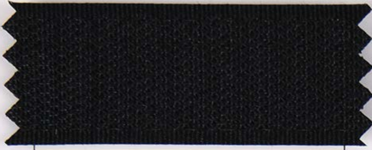
Polyester Nylon Hook