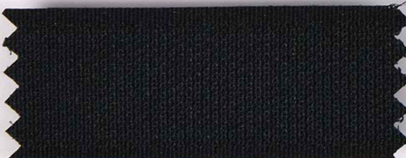
100% Nylon Fire Retardant Hook

Application: Shoes, hat, household products, curtain, toys etc.