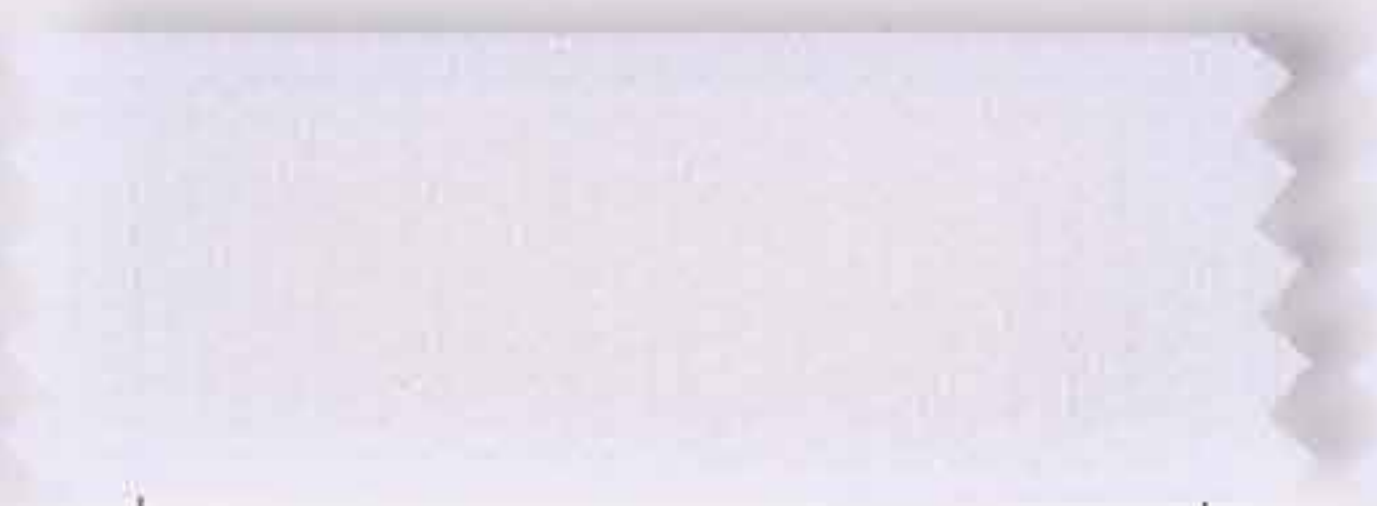
High Frequency Welding Hook