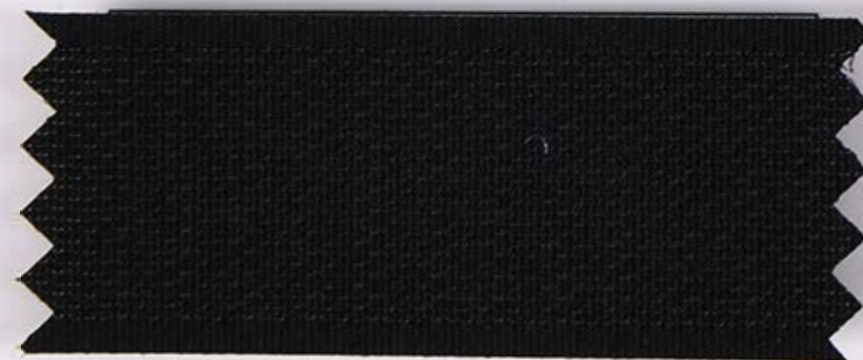
100% Nylon Soft Hook

Application: apparel, shoes, straps, etc.