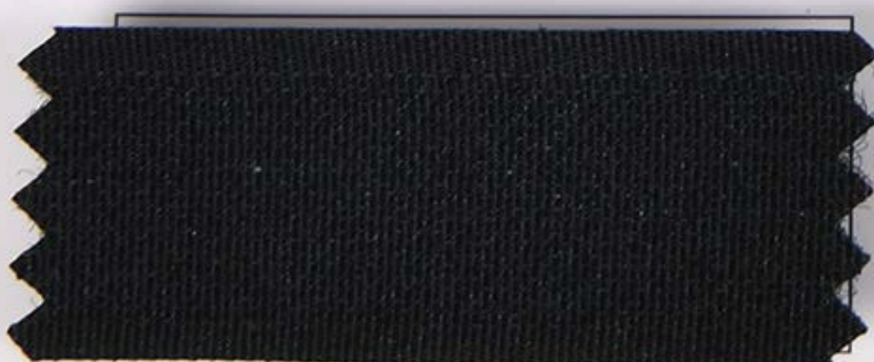
100% Nylon Fire Retardant Loop

Application: Aircraft and ships, automotive seat interiors, home textiles, firefighting equipment and other civil and industrial supplies that require fire protection.