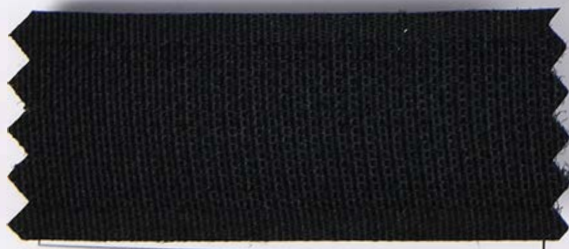
Polyester Nylon Loop

Application: Shoes, apparel, hat, household products, etc.