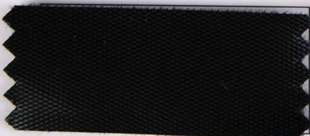
100% Nylon Back to Back Hook and Loop

Application: It's designed for skin friendly device with easy peel, like blood pressure monitors, belts, and children's clothing, also widely seen in sports braces, yoga and gym mats.