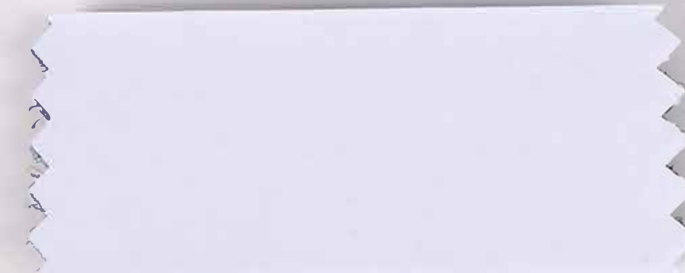
Self-adhesive Hook and Loop

Application: Stationery supplies, packaging materials, toys, curtains, household items, etc.