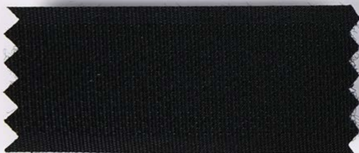
100% Nylon Loop

Application: Shoes, apparel, hat, household products, medical products, sports products, etc.