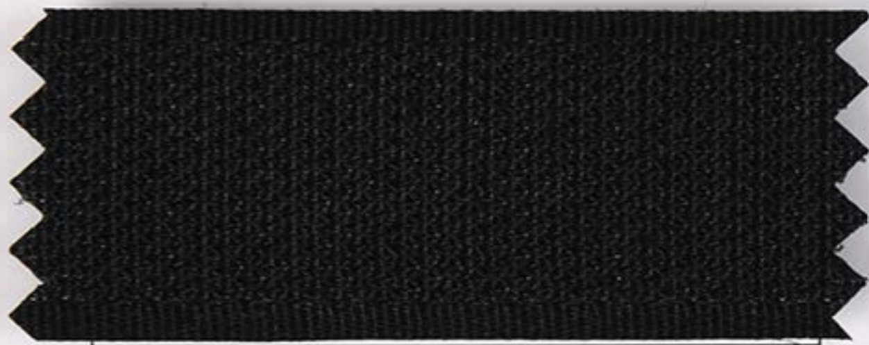
100% Polyester Hook

Application: Shoes, apparel, hat, household products, curtain etc.