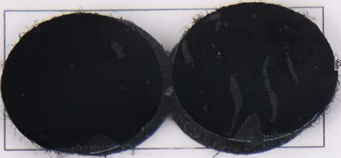
Selfadhesive Die-cut Hook and Loop