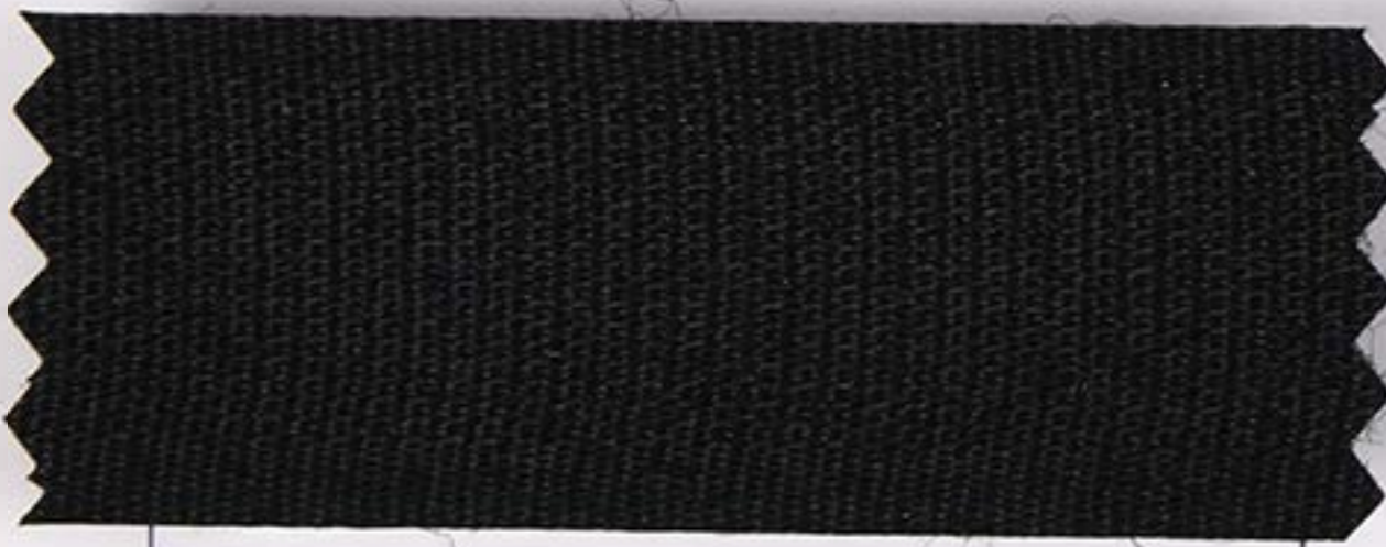
100% Polyester Loop

Application: Shoes, hat, household products, curtain, toys etc.