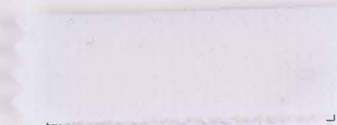
100% Nylon Mushroom Hook