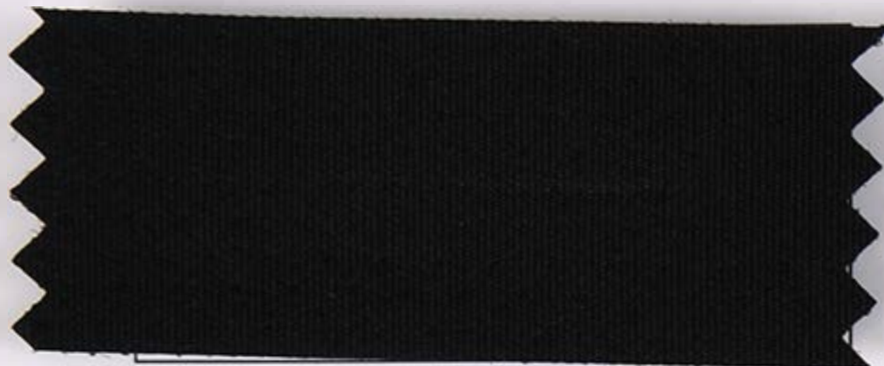
100% Nylon New Un-Napped Loop

Application: Sportswear, down jackets, sports shoes, belts, outdoors and medical products