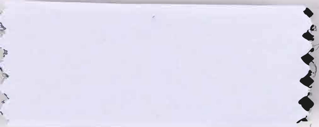
Self-adhesive Hook and Loop

Application: Household, daily necessities, anti-mosquito nets.